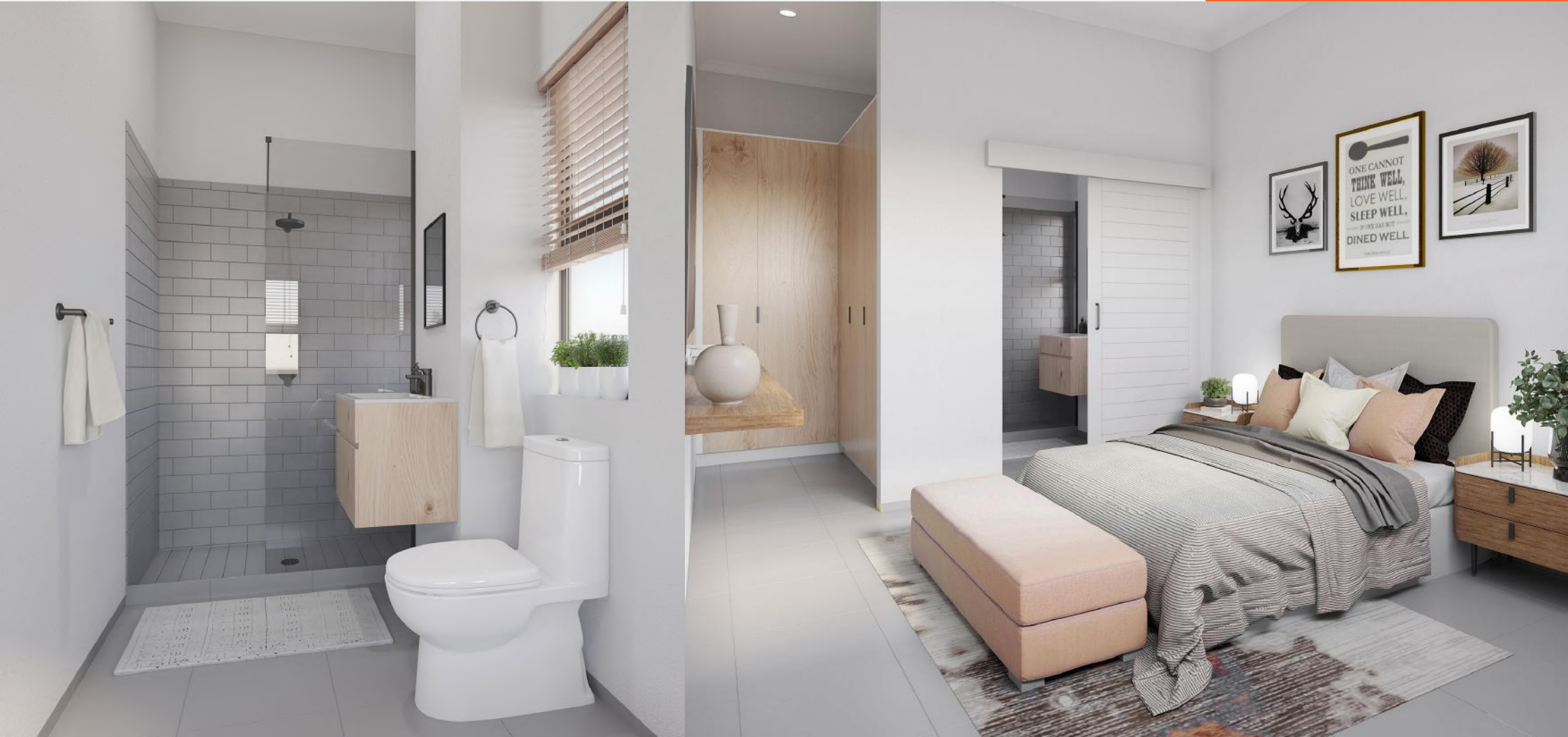
High quality finishes