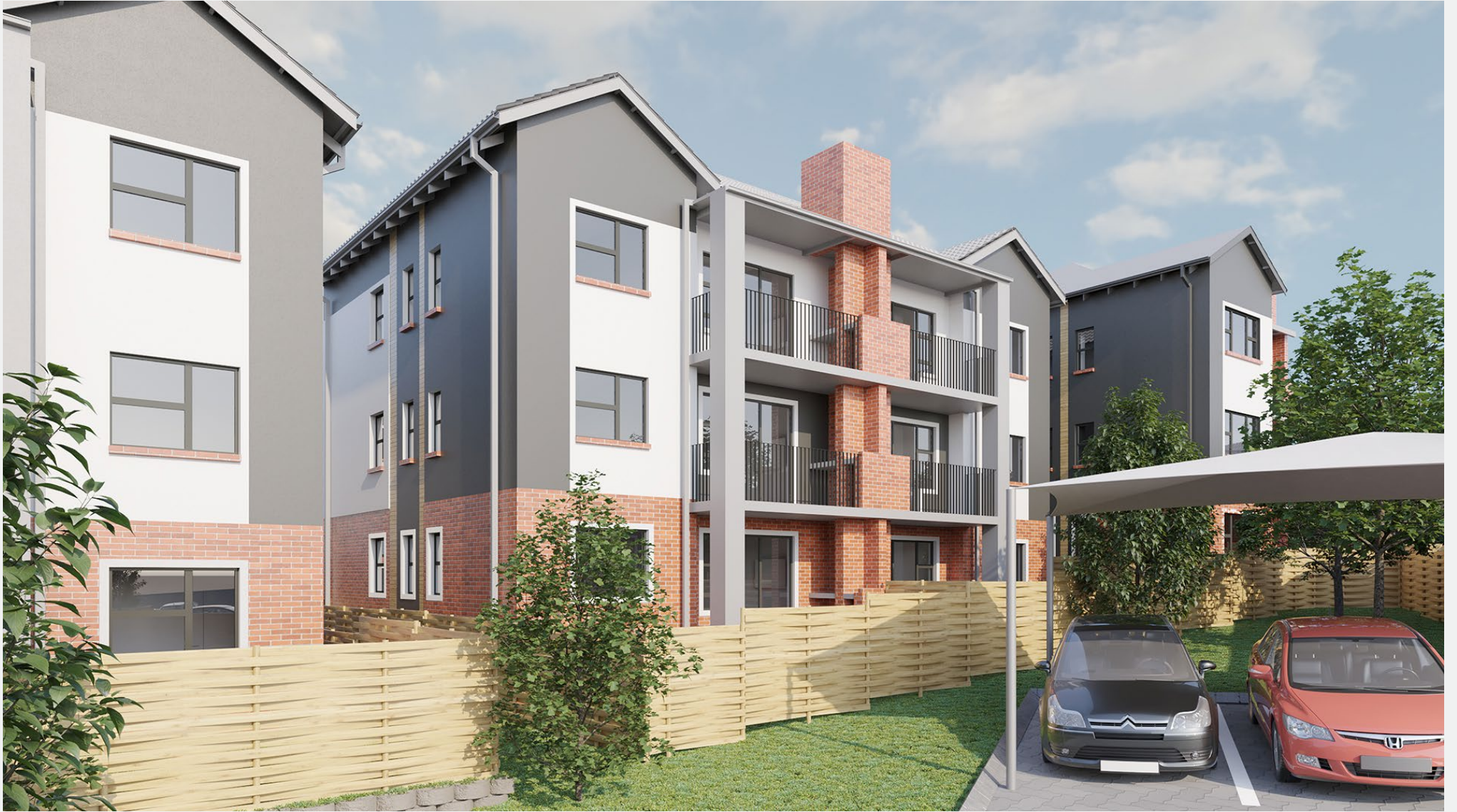
Perfect 2 and 3 bedroom homes in Little Falls