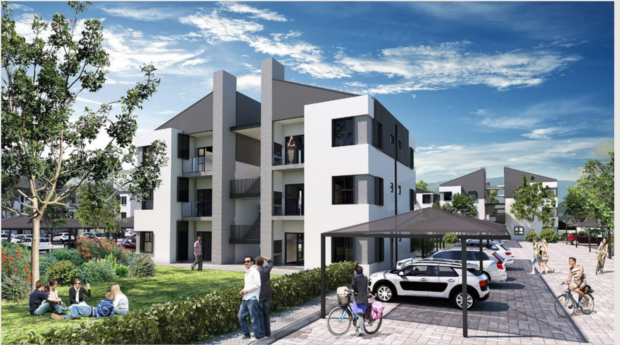
Designated covered parking